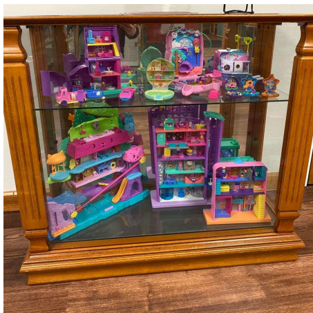
Astrid Bilodeau shared her collection of Polly Pocket figurines and play structures.